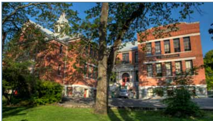
Lampson Street School