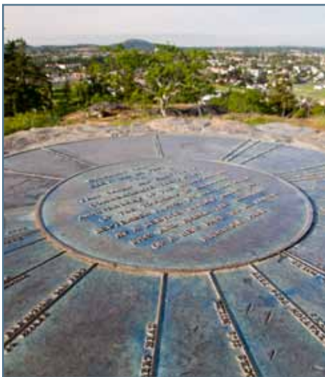
View From Cairn Park

Buses are available here, or it is a short walk to Esquimalt Road and Head Street, or the Esquimalt Plaza where shops and restaurants are available.