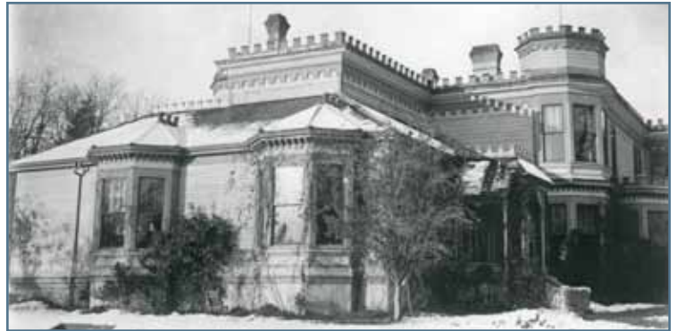
Original Fernhill, 8 rooms (top) and Expanded Fernhill, 22 rooms (bottom)