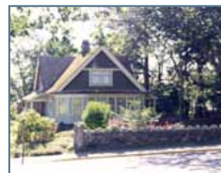
Clockwise from left: 727, 729 and 733 Lampson Street